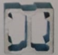
CROSS SECTION SQUARE BAR