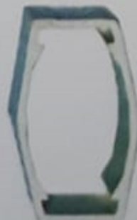
CROSS SECTION FRONT ARM