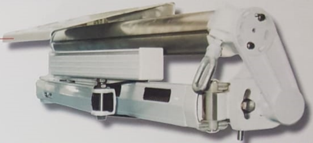
CONSTRUCTION OF A SOLARSHADE FOLD ARM