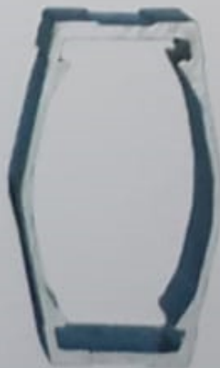
CROSS SECTION BACK ARM