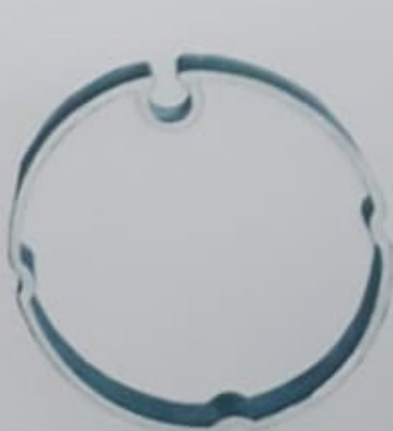
CROSS SECTION ROLLER