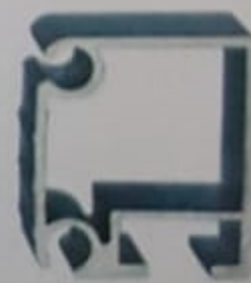
CROSS SECTION FRONT/VALANCE BAR